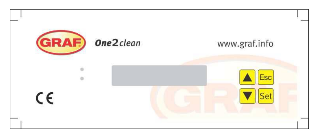
Figure 2: View of the operating unit