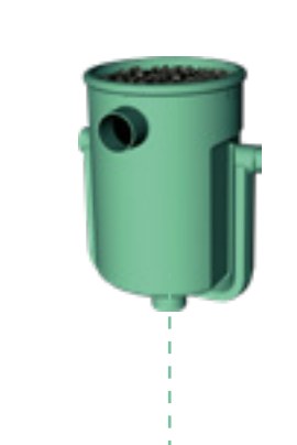
40 l Anaerobix filter kit