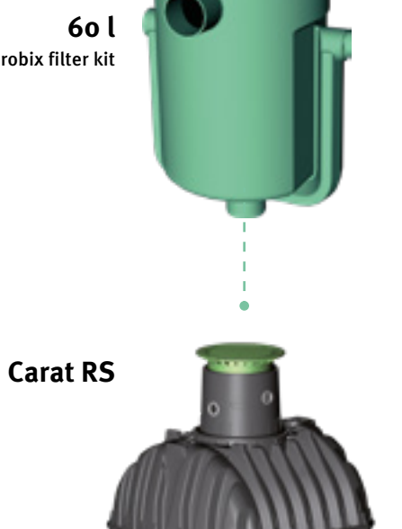
60 l Anaerobix filter kit